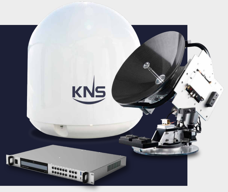
*Design is subject to change without notice

Choose the Z-series Mk4 if you are searching for the perfect and sophisticated solution for vessels. All aspects of design have been upgraded including mechanical, electrical and RF parts with user-friendly and new functions. This improvement will convince you of much higher tracking accuracy than the previous versions, which certainly brings you the great satisfaction.